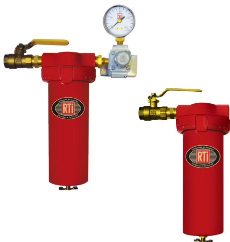
STEALTH 6950B & STEALTH 6900B

For use with air tools, sand blasting, sanding impacts, buffing; Ideal for mechanical section of body shop: