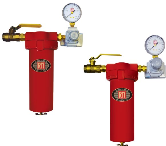
STEALTH 7000B & STEALTH 7030B

Perfect after-filters for desiccant dryers and as final paint air filter & control unit: