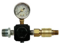
RG1 Regulator Assy