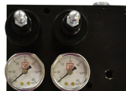
MRAS-2XR Multi-Regulator Air Station