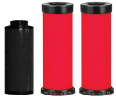
PERF-25-MK PERF Maintenance Kits (also available: PERF-50-MK)