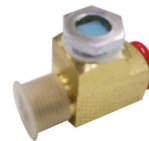
RTi-04-CK Moisture Indicator Assy