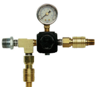
RG2 Regulator Assy