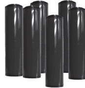
DE406 (6) Pack of DE401