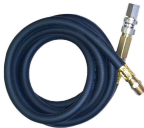
35' non-gassing hose assembly