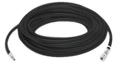
50' non-gassing hose assembly