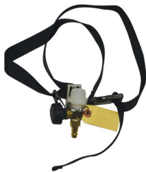
Flow control valve and belt assembly